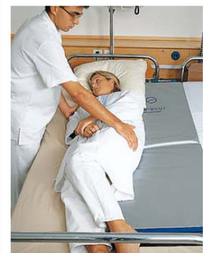
Illustrative supplier photo

Five specialist 'roll boards' have been bought by the neuro critical care unit with £1775 of charitable funds to aid with transferring patients from beds to CT and MRI scan tables. The lightweight 'no lift' roll boards are safe and comfortable for patients and prevent back injuries in staff, helping to make the process of transferring patients smoother and more effective.